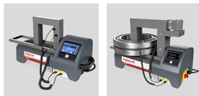
The PRO series – heaters ready for industry 4.0