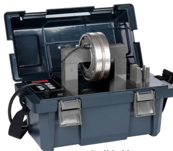
Portable handy heater

The easy series equipped with control keyboard and magnetic temperature probe offers all the advantages of modern heaters such as time or temperature control, demagnetizing, retaining original lubrication.